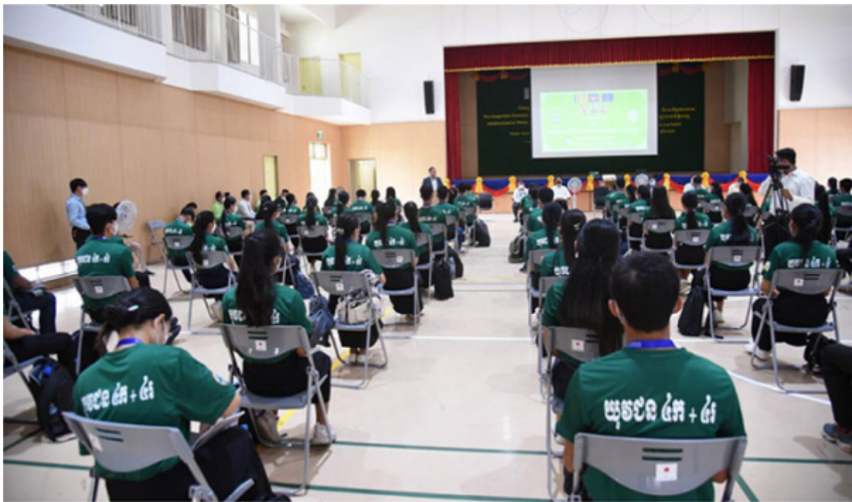
Participants in the training course on reducing plastic waste

A training workshop was held by the Ministry of Environment to implement the 4Rs of environmental protection , with the goal of minimizing plastic waste. This training is very important as part of a joint action to reduce plastic waste to improve environmental quality, clean living, and waste management in urban areas. In addition, it will offer additional knowledge to disseminate and share knowledge to participate in reducing plastic waste and promote this activity to improve the management of solid waste.