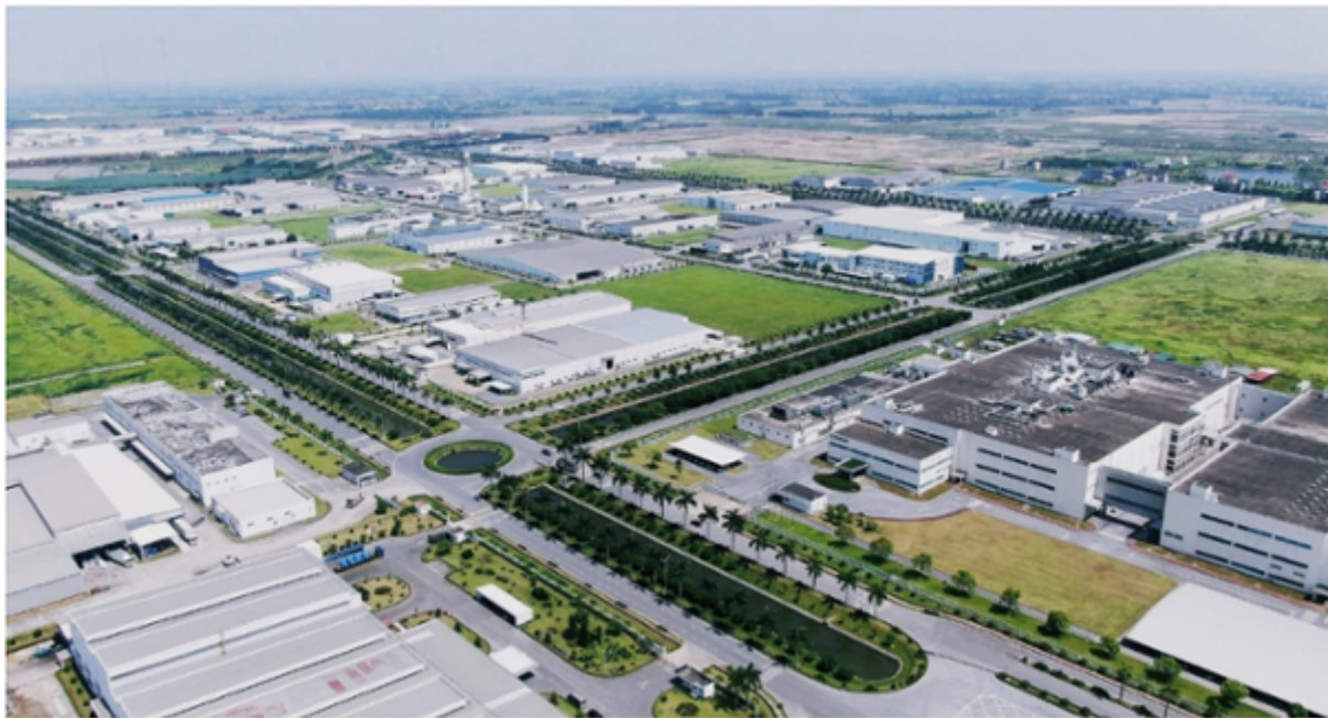
Thang Long Industrial Park in Vietnam

V ietnam will remain one of the best investment destinations for industrial real estate in Southeast Asia for the next 10 years and beyond, experts said at a conference in Ho Chi Minh City last week.