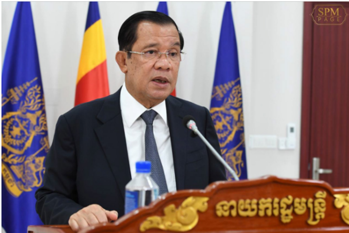
Prime Minister Hun Sen during a speech in Cambodia

P rim Minister Hun Sen announced that the Royal Government of Cambodia has decided to cancel the PCR test requirement for entry into Cambodia and allow the resumption of visas on arrival in order to boost investment, business, and tourism in Cambodia, as well as save money on test equipment and medical equipment.