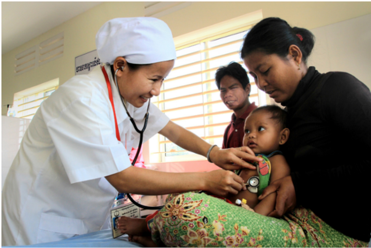
Healthcare worker in Cambodia

The World Bank has approved $113 million in new financing to improve access to quality health care in Cambodia.