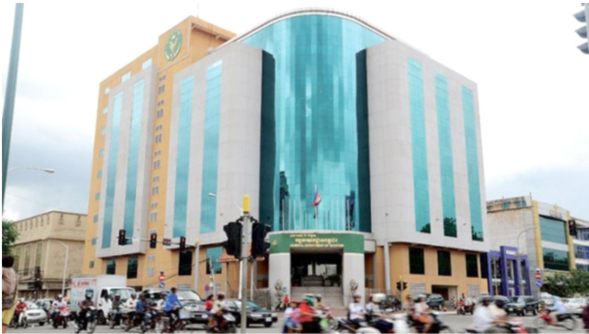
General Department of Taxation Phnom Penh, Cambodia

From 14 March 2022, taxpayers or their agents who voluntarily request a correction of "unintended errors" in accounting records and tax returns will be permitted to receive incentives: