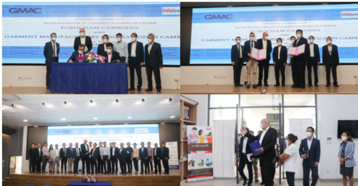
EuroCham and GMAC signed an MoU on March 16th

The European Chamber of Commerce in Cambodia (EuroCham Cambodia) and GMAC - Garment Manufacturers Association in Cambodia today reinforced their strong relationship by the signing of a Memorandum of Understanding (MoU). Symbolically, the MoU was signed on 16th March 2022 at the facilities of the Cambodian Garment Training Institute (CGTI) in Phnom Penh.