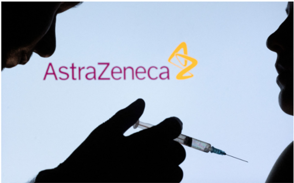
People hold a syringe with a needle in front of the AstraZeneca logo

A straZeneca's antibody-based COVID-19 treatment for adults with poor immune response, which has been approved by the Britain medicine regulators, marking a major step in the fight against the pandemic as infections surge globally amid spread of the Omicron variant.