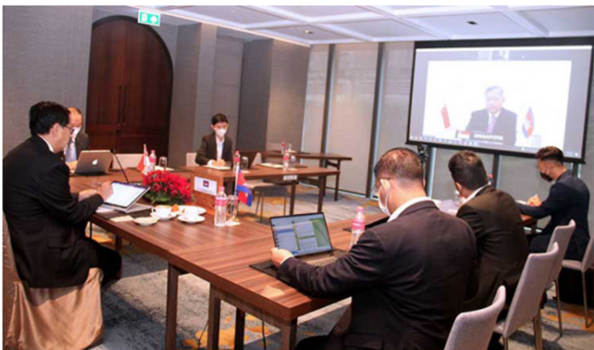
Videoconference between the Commerce Minister, Pan Sorasak and Singapore's Trade and Industry Minister, Gan Kim Yong, Ministry of Commerce