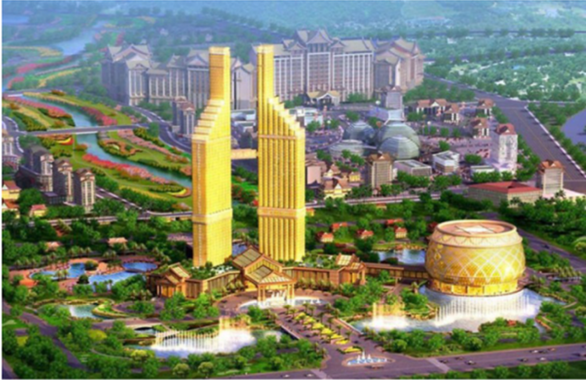
Sithandone SEZ Development Project

S iphandone is an archipelago of islands located near the Laos-Cambodia border in the Mekong River, roughly 140 kilometers from Pakse, the capital of Champasak province. It is a large section of the Mekong River, which is wide at this point and forms multiple channels, resulting in numerous islands and rapids. Under a development project being carried out by Sithandone Joint Development Co Ltd (STD), the Sithandone Special Economic Zone or new Siphandone area will reshape the so far natural environment to create a familiar development concept.