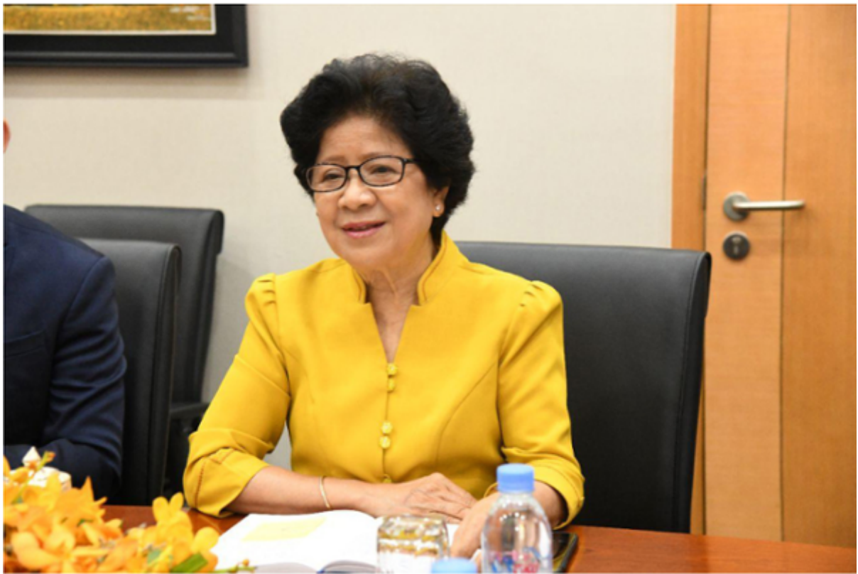
Her Excellency Neav Chanthana, Deputy Governor of the National Bank of Cambodia

The United Nations Economic and Social Commission for Asia and the Pacific (ESCAP) partners with the National Bank of Cambodia and Good Return to launch the "Let's Talk Money: Little by Little", a financial literacy campaign aimed at promoting women's financial inclusion. The campaign includes a series of videos on financial literacy as well as face-to-face training sessions with 1,000 garment workers and 300 women entrepreneurs. The series embodies a wide range of messages about financial responsibility, equal participation of men and women in financial decisions, and entrepreneurial ideas, all of which are essential to achieving an inclusive and sustainable economy.