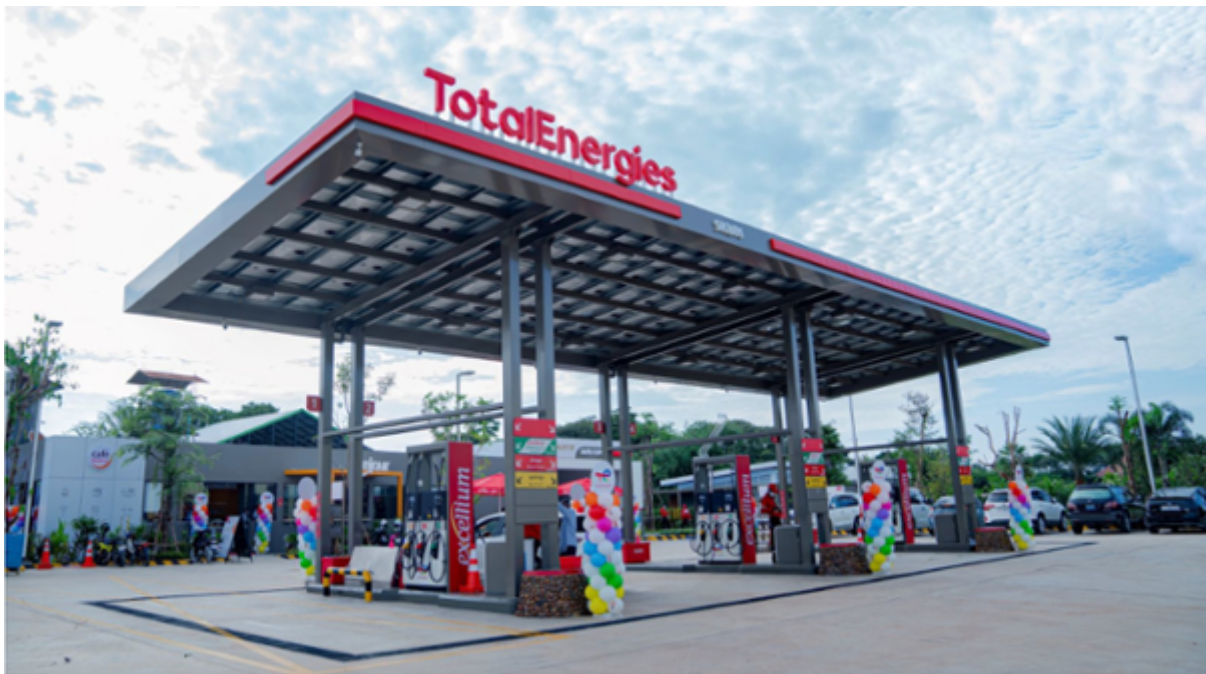
TotalEnergies station in Cambodia

A ccording to the Ministry of Commerce, the government will make adjustments to the prices of petrol every 10 - 15 days to address the fluctuating price of crude oil in the international markets to support local consumers and enterprises. Gasoline prices are currently at 4,800 riel ($1.18) per litre, while diesel is priced at 4,500 Riel ($1.11). However, fuel prices are expected to increase due to the international crude oil price fluctuations.